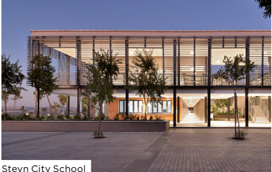
Steyn City School

B+P has successfully delivered a wide range of projects in 10 countries beyond South Africa. Additionally, the company has provided design