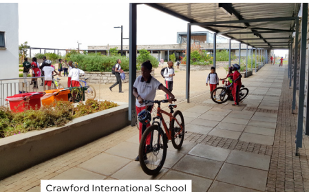
Crawford International School

School in Johannesburg, where B+P collaborated with SCAD in a joint venture and incorporated design methods tailored to various age groups. The project encompasses thoughtfully designed interactive play areas for pre-schoolers, a state of the art library equipped with cutting-edge technology, and a science laboratory for older students. Every aspect has been meticulously planned and executed, reflecting a commitment to excellence. Insights gained through the company's research in education