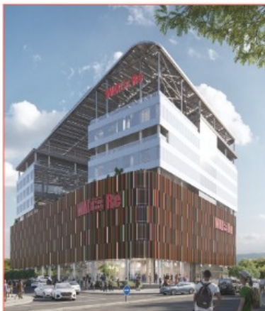
WAICA Reinsurance Corporate West Africa Regional Office in Accra, Ghana

As a partner-led practice, Boogertman + Partners works across a diverse range of sectors, including